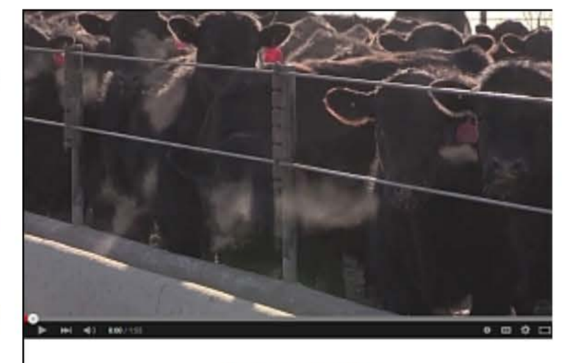
Angus VNR: Jump-start your dream

Other alternative forages include Sunn hemp, a tropical summer legume. Sunn hemp grows tall, requires cowpea or mung bean inoculant, and can be grazed or cut as forage when young. Cowpea, which is actually a bean, is another summer annual. Cowpeas can be grown as a summer cover crop and can be grazed or cut. Daikon radish can be used as a forage in spring or summer, or as a stockpiled forage or a cover crop.