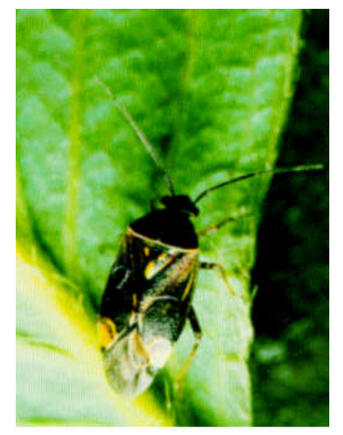
Figure 13. Adult tarnished plant bug