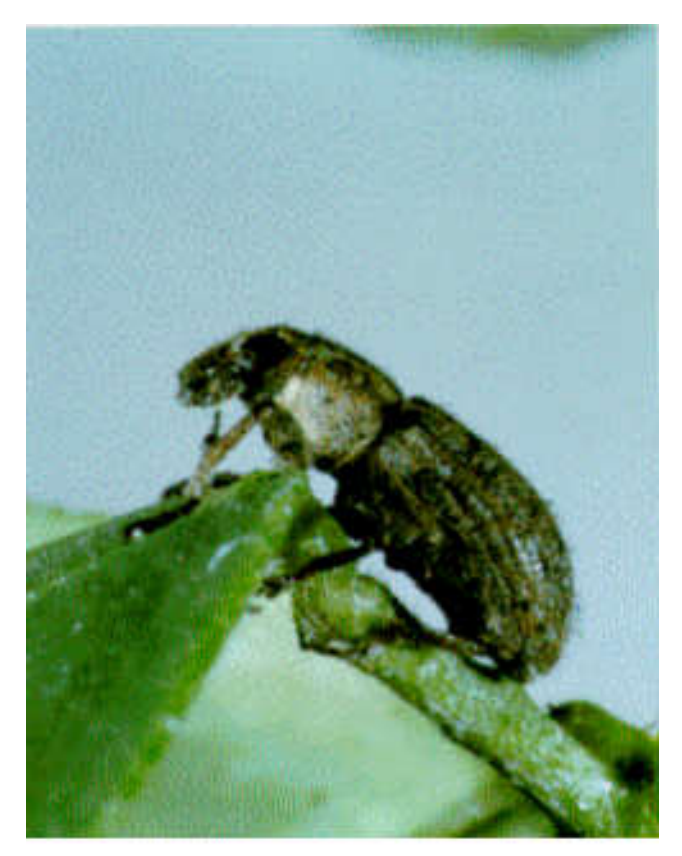
Figure 8. Adult clover root curculio

Adults chew small crescent-shaped notches in the edges of clover leaves. Unless adults are numerous, this damage is unimportant. The larvae feed on the roots, causing a pitting and scarring of the surface. This damage may contribute to general decline of the stand. No control suggestions have been established.