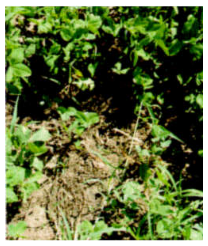
Figure 7. Dead plants in stand killed by sclerotinia