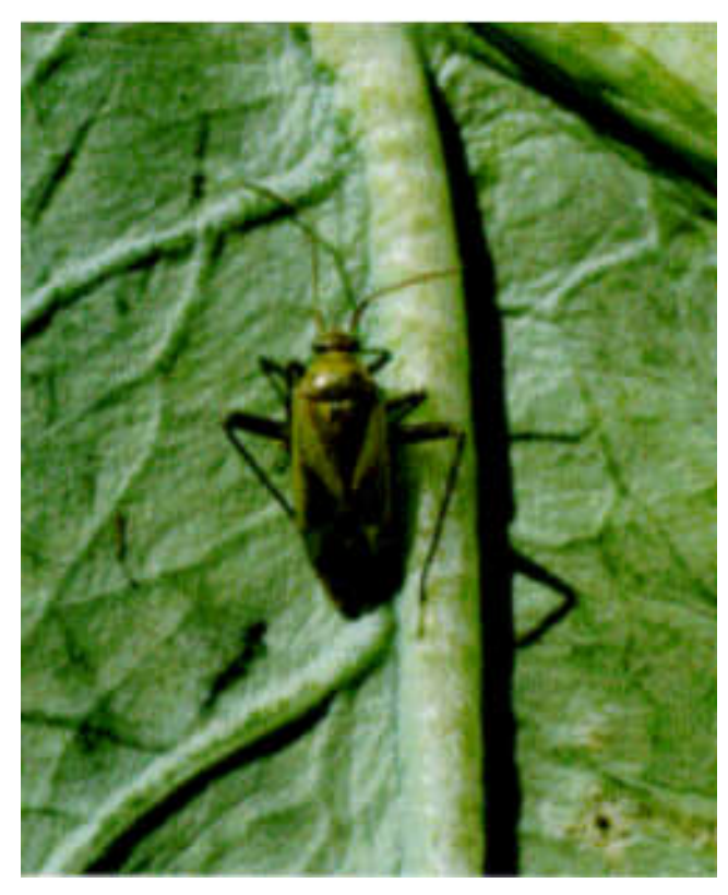
Figure 14. Adult alfalfa plant bug