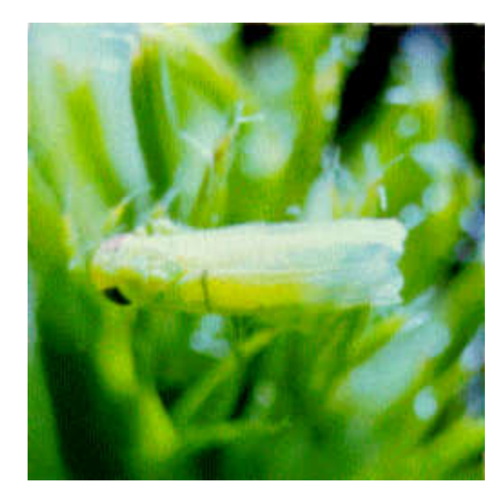
Figure 12. Potato leafhopper

Leafhoppers damage plants by sucking plant sap and injecting a plant toxin during feeding. There is also disruption of the plant's vascular tissues. Red clover shows less yellowing and stunting than infested alfalfa plants. Treatment thresholds have not been developed for red clover.