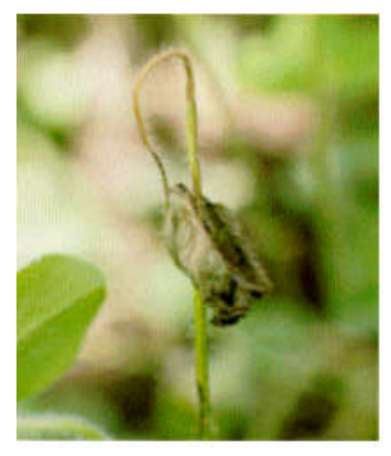
Figure 4. "Shepherd's crook," dead shoot tops caused by severe anthracnose