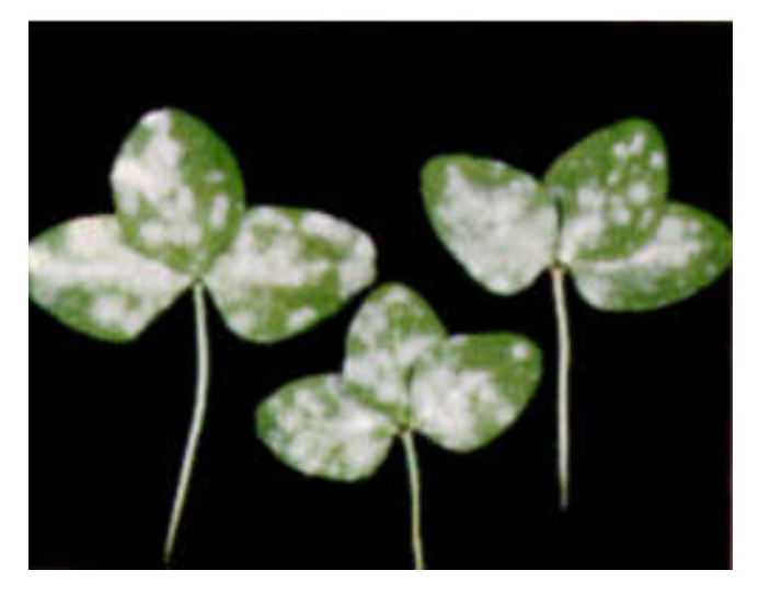
Figure 5. Gray to white powdery layer typical of powdery mildew