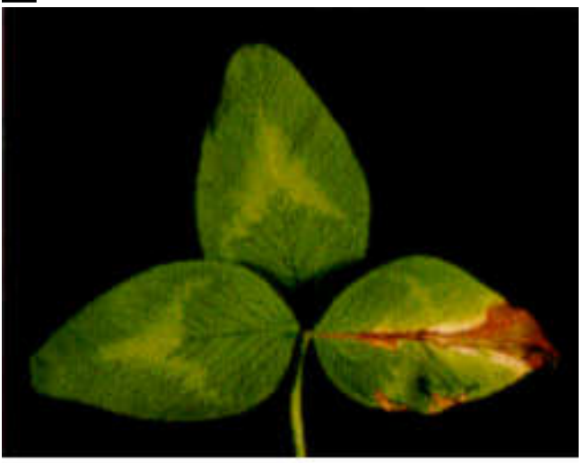
Figure 3. Brown leaf blotches caused by anthracnose