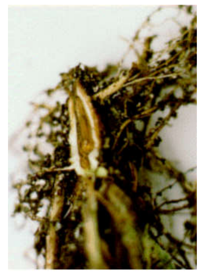
Figure 6. Brown root discoloration caused by fusarium

On other crops it is often referred to as "white mold" disease because of a conspicuous, fluffy growth that sometimes occurs over infected tissue. Plants are infected in late summer and early fall. They survive the first harvest of the following season and then die. In Wisconsin, the crown and lower stems of red clover are usually attacked. Infected stems and leaves lose turgidity, and often collapse quickly. Usually individual plants are attacked, while patches of infected plants are evident in other instances. The best identifying feature of the disease is the hard, black sclerotia (dormant fungal mass) about the size and shape of a bean seed that is usually associated with the damaged tissue. Look for them embedded in the crowns or stems.