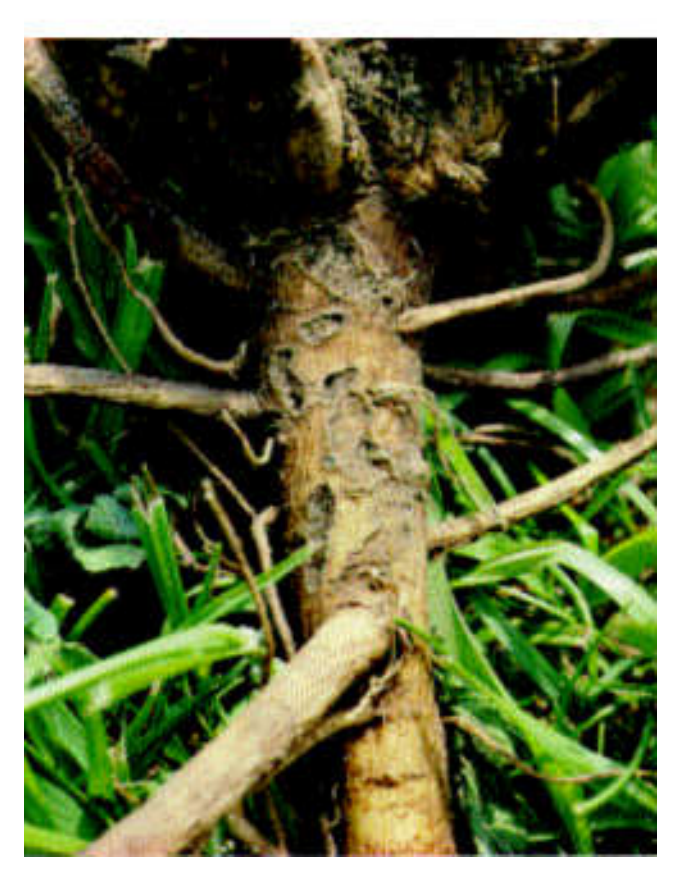
Figure 9. Pitted and scarred root surface caused by root curculio feeding