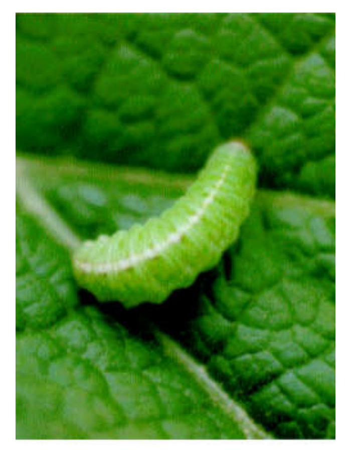
Figure 10. Clover leaf weevil larva