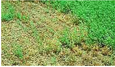
Texas root rot.

Phymatotrichum Root rot ( Phymatotrichum omnivorum ) is commonly known as Texas root rot and infects more than 2000 species of broadleaf plants. This fungus is active in alkaline soils and prefers the hot summer temperatures of Texas and the Southwest. Infected plants will exhibit water stress and wilt during the summer, and when pulled will break off below the crown. The vascular system near the crown will be brown and the roots rotten. The infected area in an alfalfa field will grow outwards as the disease spreads,