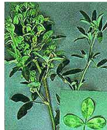
Examples of downy mildew.

Downy Mildew ( Peronospora trifoliorum ) is a foliar disease that occurs when weather conditions are cool and wet. It appears as a grayish-white, powdery growth (spores) on the bottom side of the leaves. The corresponding top portion of the leaves will be yellowish. Once the disease becomes systemic it will stunt the plant, thickening the stems and distorting leaves. The initial infection occurs as spores germinate on wet leaves. Once the weather warms up and the environment becomes drier, the disease will cease until the conditions for its development once again become favorable. Resistant varieties, seeding in spring instead of autumn, and early harvest in spring are cultural practices that may reduce the severity of this disease.