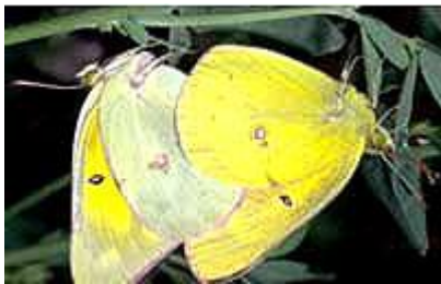
Alfalfa caterpillar butterfly.

Bacillus thuringiensis is an effective biorational pesticide that controls caterpillar pests. Early detection and application during the early developmental stages of the larvae (1st and 2nd instar) make these pesticides more effective. Pheromone traps are useful tools that indicate when mating flights are occurring. Through degree-day calculations from mating time, one can estimate egg laying and hatching. For information on degree-day calculations contact your local county Extension agent. Pheromone lures and dispensers are becoming popular for mating disruption of some caterpillar pests. These must be deployed and timed with the insects' mating flights in order to cause confusion and interrupt potential mating.