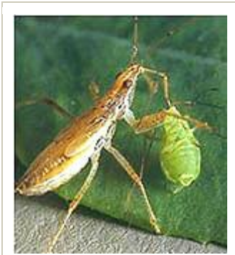
Damsel bug – nymph.