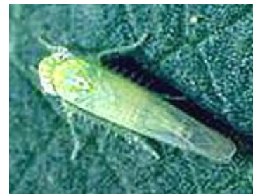
Potato leafhopper.

The potato leafhopper is a serious pest of alfalfa in the eastern U.S. Like aphids, they pierce stems and suck plant juices, disrupting plant functions. The symptoms are stunting and yellowing of the crop, but once the symptoms are visible, the damage to the crop is done. Scouting is critical to prevent this from happening. The adult leafhoppers are about 1/8 inch long, green insects with wings that when at rest resemble pup tents. Immature leafhoppers are called nymphs and look like wingless adults. Both the adult and nymph feed on plants.