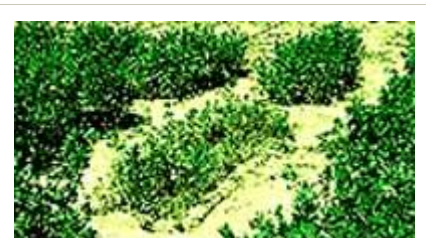
Example of alfalfa with Phytophthora root rot.

Phytophthora root rot ( Phytophthora megasperma ) is a water-mold fungus that thrives in saturated, poorly drained fields. Good land preparation, careful irrigation management, and the use of resistant varieties are cultural practices that can keep this disease under control. After a hay cutting, irrigation management is critical, since older plants that have their shoots removed showed significantly more Phytophthora damaged than younger plants under the same saturated conditions. ( Barta and Schmitthenner, 1986 ) Symptoms include yellowing and defoliation of older leaves, wilting, and slow growth of plants. Infected plants