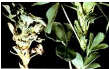
Stem nematode damage.

Plant parasitic nematodes are microscopic worm-like animals that attack plant roots, creating galls that limit water and nutrient uptake. This results in weakened plants that are susceptible to further pest attack. Nematode control is essentially prevention, because once a plant is parasitized it is impossible to kill the nematode without also destroying the host. The most sustainable approach to nematode control will integrate several tools and strategies, including cover crops, crop rotation, soil solarization, least-toxic pesticides, and plant varieties resistant to nematode damage. These methods work best in the context of a healthy soil environment with sufficient organic matter to support diverse populations of microorganisms. A balanced soil ecosystem will support a wide variety of "biological control" organisms that will help keep nematode pest populations in check. For more information on nematodes and their controls, request the ATTRA publication Alternative Nematode Control .