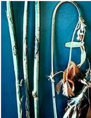
Examples of plants with anthracnose.

Stagonospora Rot ( Stagonospora meliloti ) is a fungal disease that attacks the crown and roots of the alfalfa plant. Symptoms on the leaves are irregular tan spots with brown borders. As the spots enlarge they form concentric rings, with small, round black spots forming in the center of the tan spots. The spores are released from these small black spots and are dispersed by splashing water from rain or irrigation. Symptoms on a cross section of the tap root consist of reddish spots on the tissue. There are no known resistant varieties. Rhizoctonia ( Rhizoctonia solani ) is a fungus that creates necrotic spots or cankers on roots, crowns, and stems and will cause blight on leaves. It is promoted by wet soil conditions and high temperatures. Root damage in established plants appears as round and oval lesions (cankers) on the taproot. During the summer when the pathogen is active, the lesions are brown to tan in color, while during the winter the lesions are black. There are some alfalfa varieties that are tolerant.