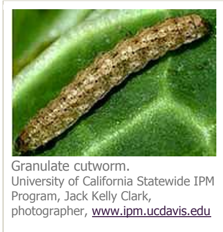
Granulate cutworm.