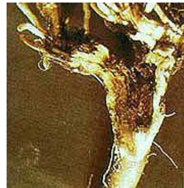
Example of fusarium wilt. © 2003 OSU, Plant and Soil Sciences Department, Oklahoma State University

or grass forages. Inoculation of alfalfa seedlings with vesicular arbuscular mycorrhizal (VAM) fungi ( Glomus spp.) produced a lower incidence of wilt than non-mycorrhizal plantings, and the number of Fusarium and Verticilium spores were lower in soils inoculated with VAM fungi than in non-mycorrhizal soil. ( Hwang, Chang, and Chakravarty, 1992 )