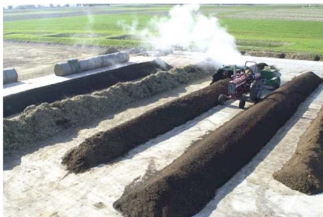
Figure 1. A windrow composting facility at The Ohio State University/OARDC.

Alternatively, organic-certified composts can be purchased commercially. Such options may provide a more consistent quality of compost, but currently only the relative NPK content can be assured. When choosing a compost product, be sure to check the chemical composition of the compost. Continuous application of compost containing a high quantity of salts and phosphorus may present problems of saline stress or nutrient imbalances in the soil and water in the long term.