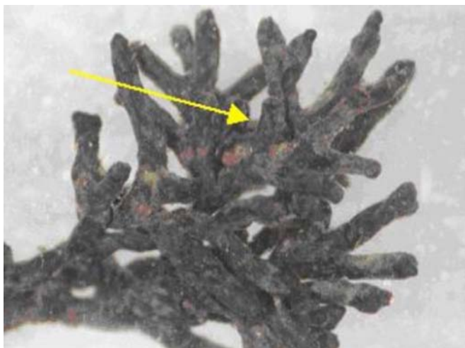
Figure 2. An example of a highly branched ectomycorrhizae root tip.