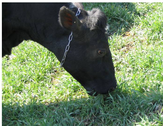
Dairy cow finishing the first of three grazings of winter rye on April 11.

They plowed a native bluegrass pasture and planted it with BMR SS, followed by an August planting of winter rye. The BMR SS provided more than three weeks of grazing during a