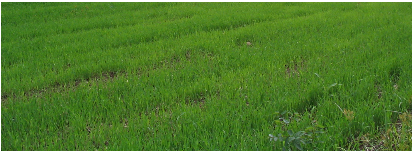
Oats planted in August after the corn was destroyed by a flood, shown in late September prior to harvest as forage.

vides high sugar levels, helping ensure good fermentation and high energy.