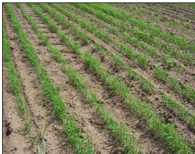
Figure 2: Teff does not tolerate frost or establish well in cold soils so delay planting until June when it is warmer.

Teff can not tolerate frost and does not establish well in cool soils. While we have not conducted any teff planting date trials in New York, teff planting should probably be delayed until June when soil and air temperatures are higher (Figure 2). Teff can be seeded from June through late July.