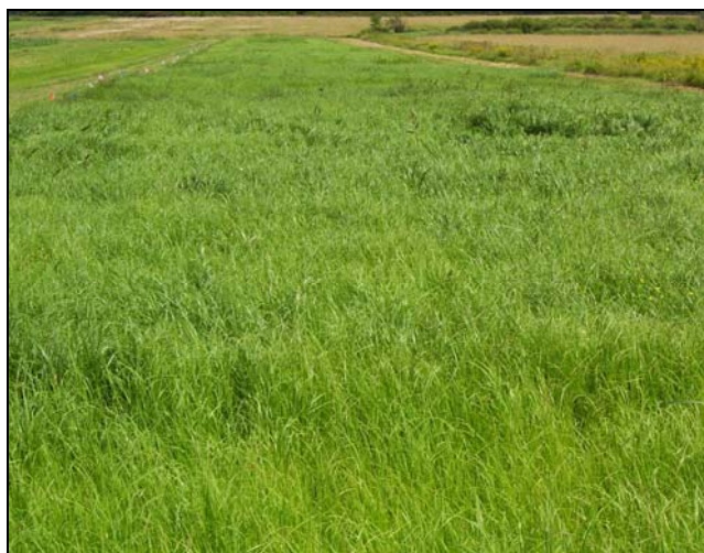
Figure 1: Teff is a warm season annual grass with great promise as an emergency forage crop in New York.

In Ethiopia, Teff is predominantly grown as a cereal crop and not as a forage crop. Teff flour is primarily used to make a fermented, sourdough type, flat bread called Injera . Teff is also eaten as porridge or used as an ingredient of home-brewed alcoholic drinks. It is high in iron content and contains very little gluten. In addition, the teff plant is used as a livestock forage or pasture crop. It is primarily grown in Africa, India, Australia and South America. In the United States, teff is grown on limited acres in the Pacific Northwest and Midwest.